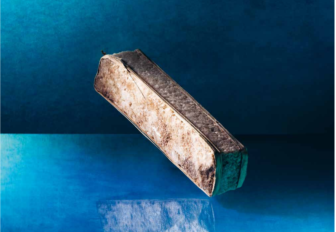
Rectangular bars wrapped in palm leaves: Ethiopian salt bars.