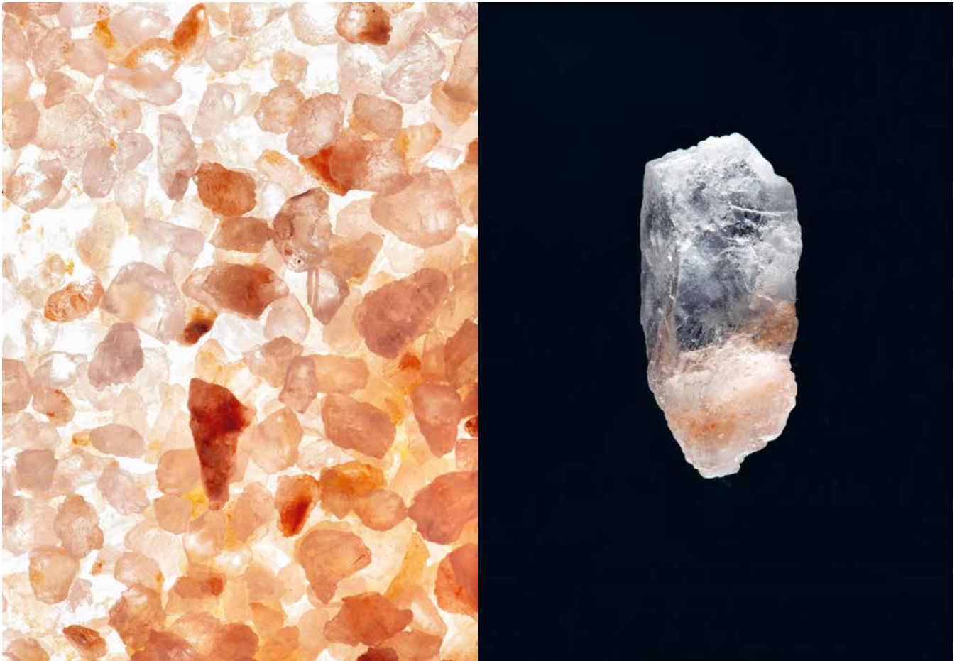
The Colour of Money – Himalayan Salt